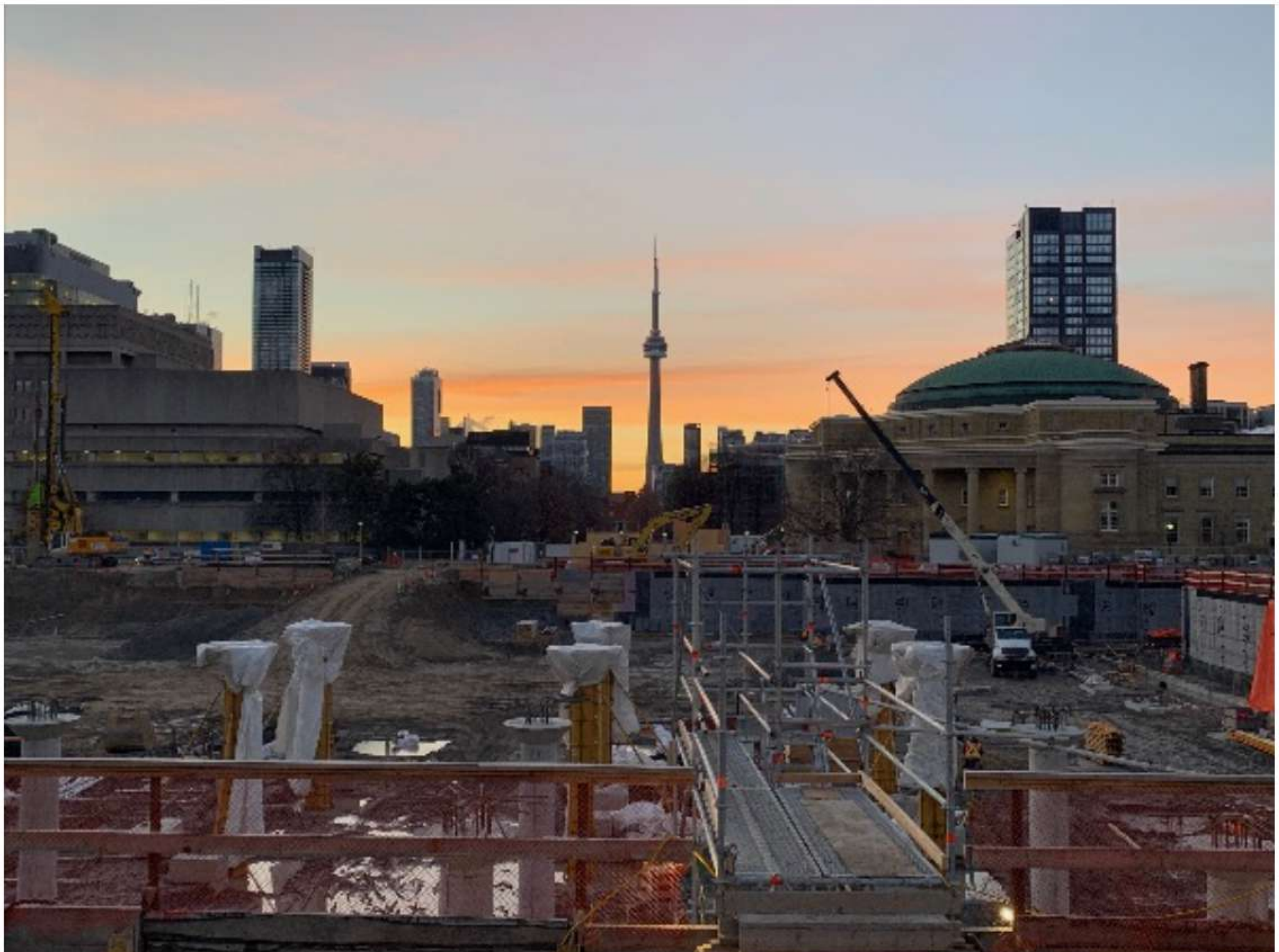
KCC - January 2022