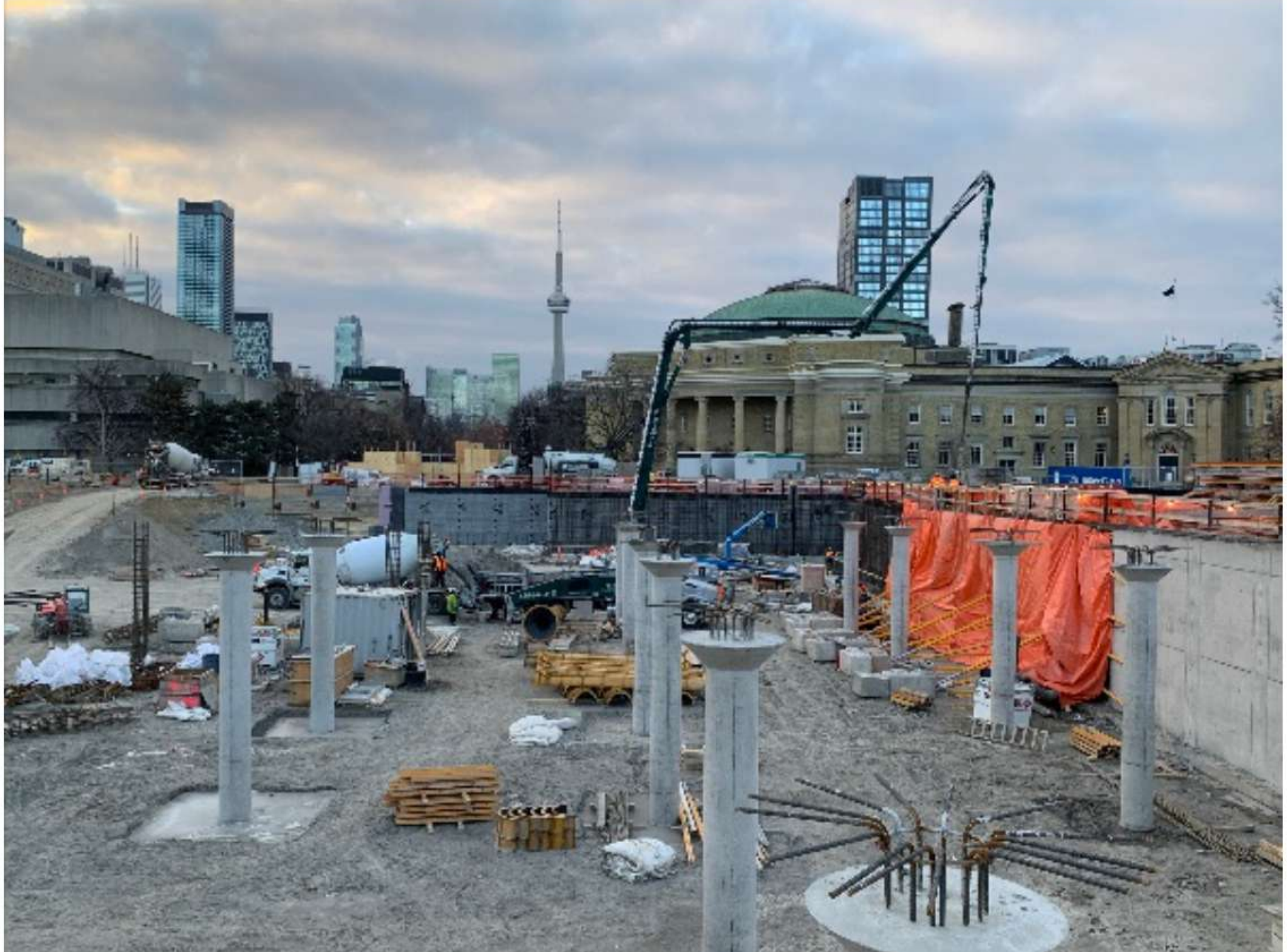
View of King's College Circle (KCC) January 2022