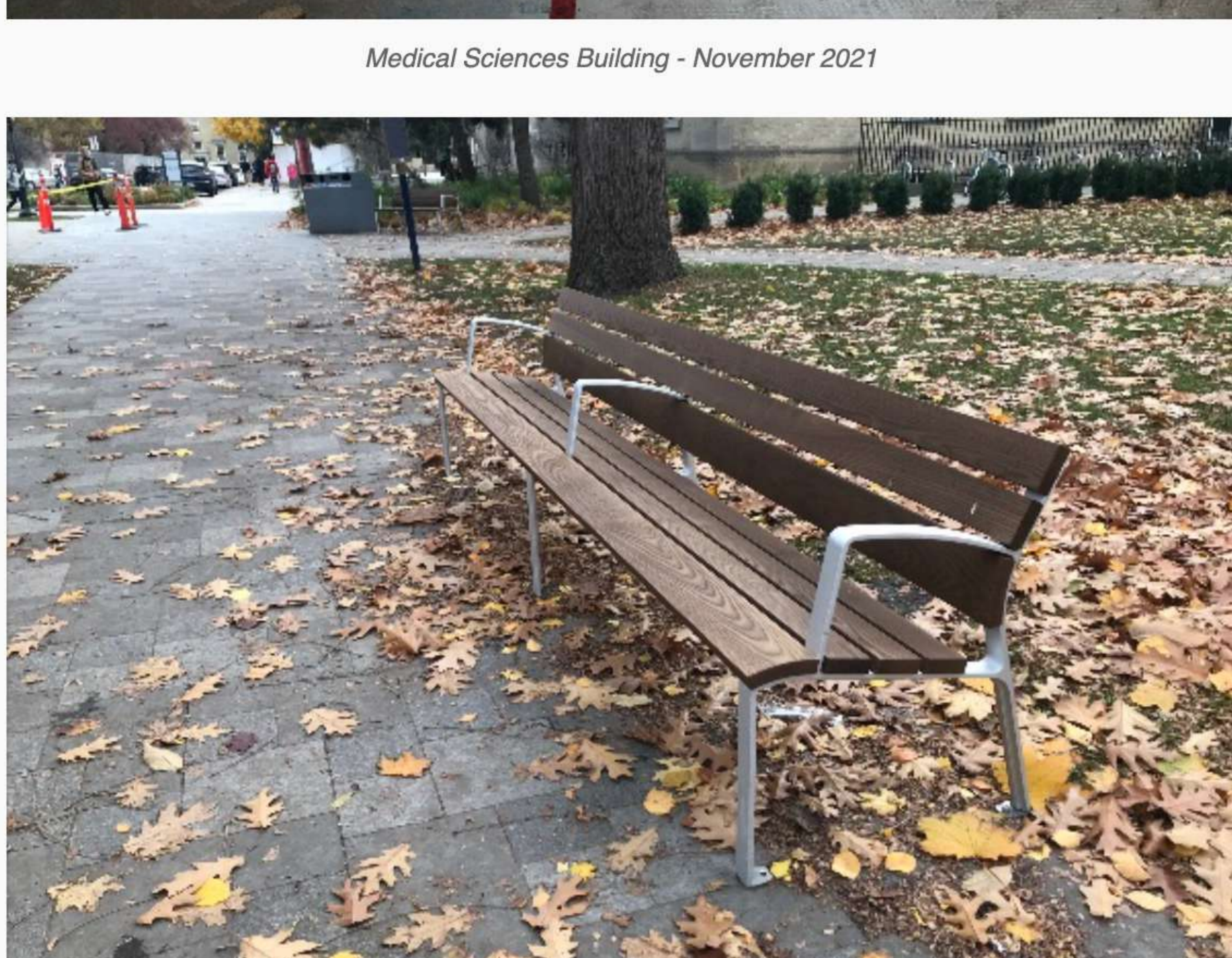
Keep an eye out for new benches!