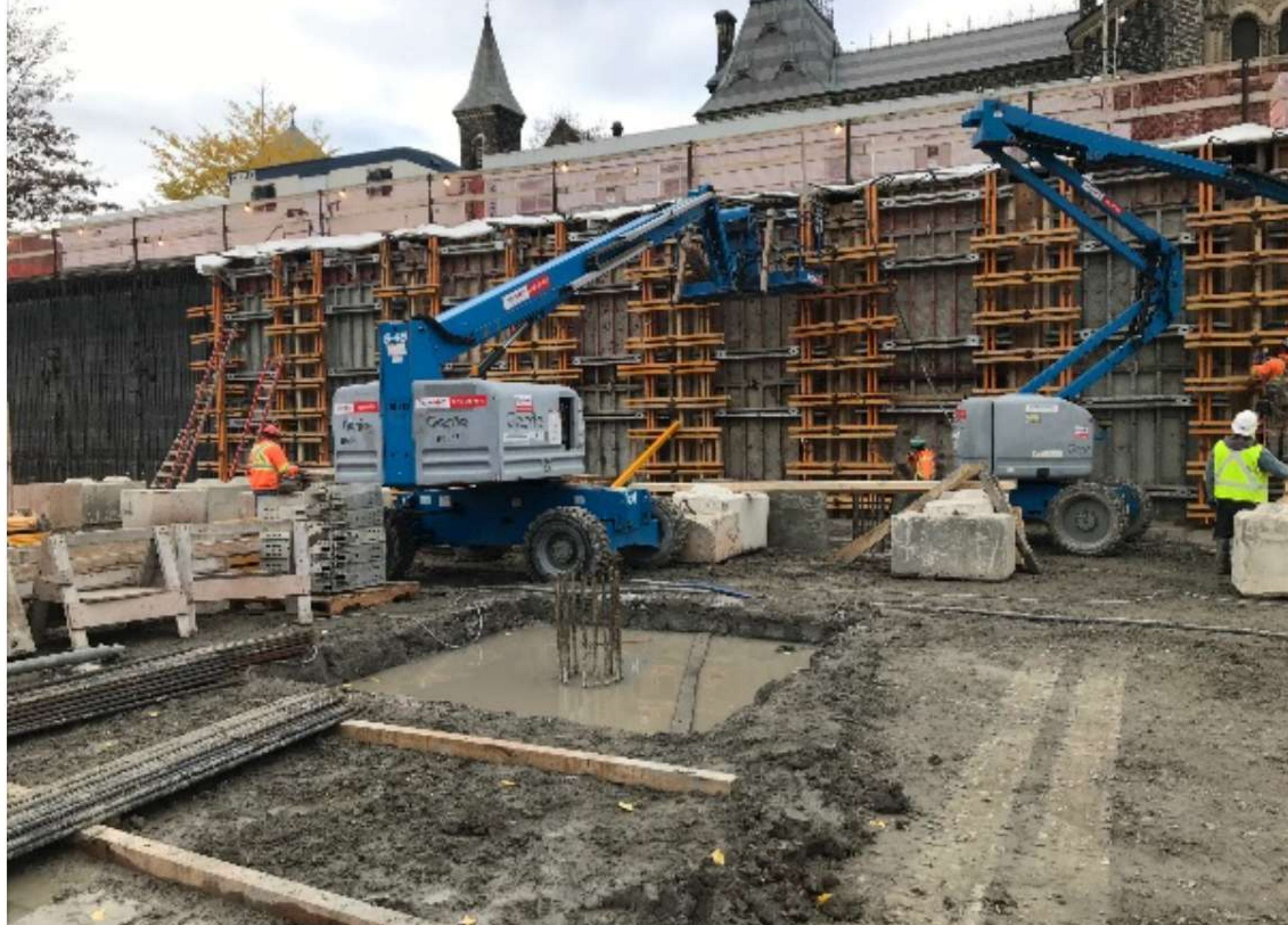
KCC - November 2021