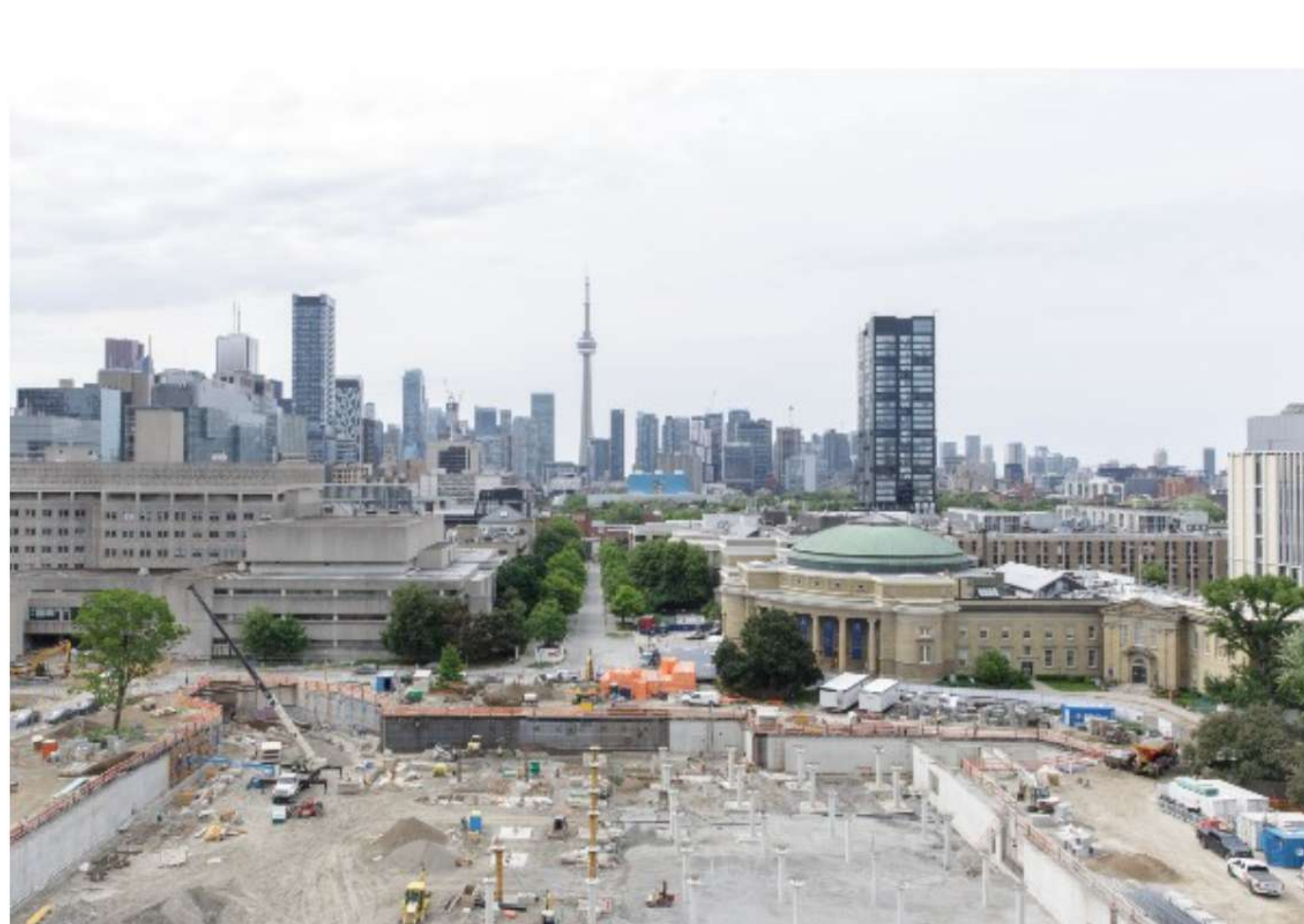
Aerial view of KCC (June 2022)