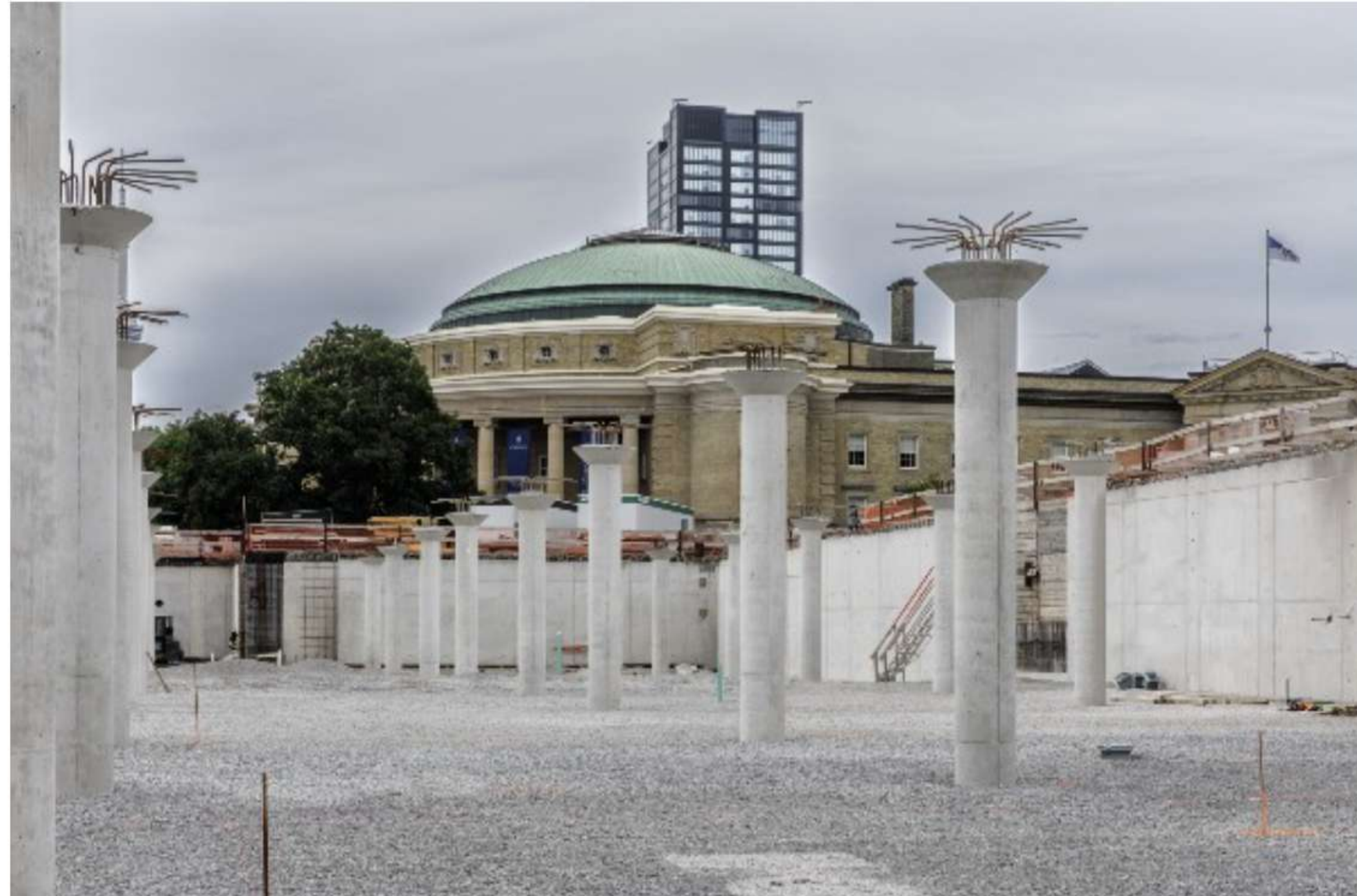
Ancient Rome has nothing on our parking garage columns