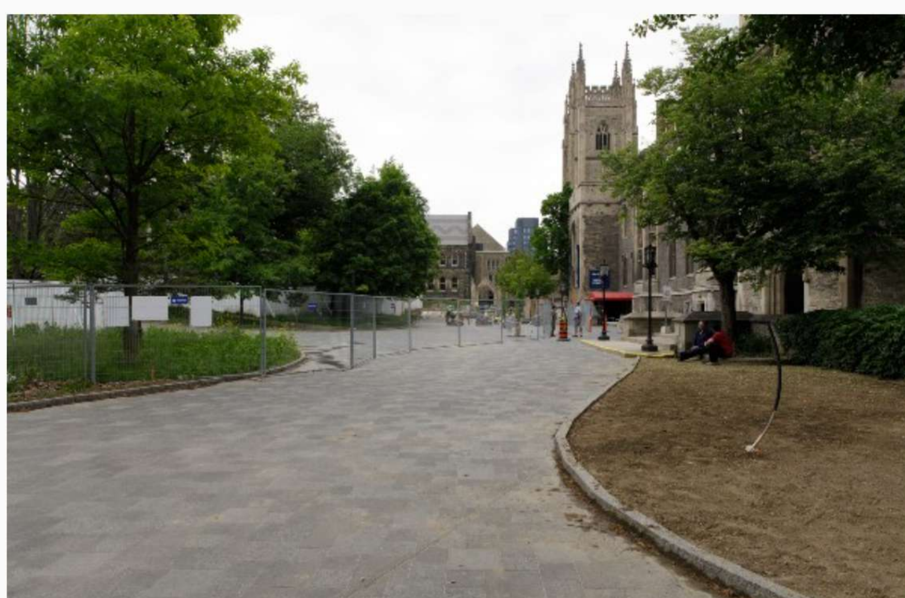
Hart House Circle (June 2022)