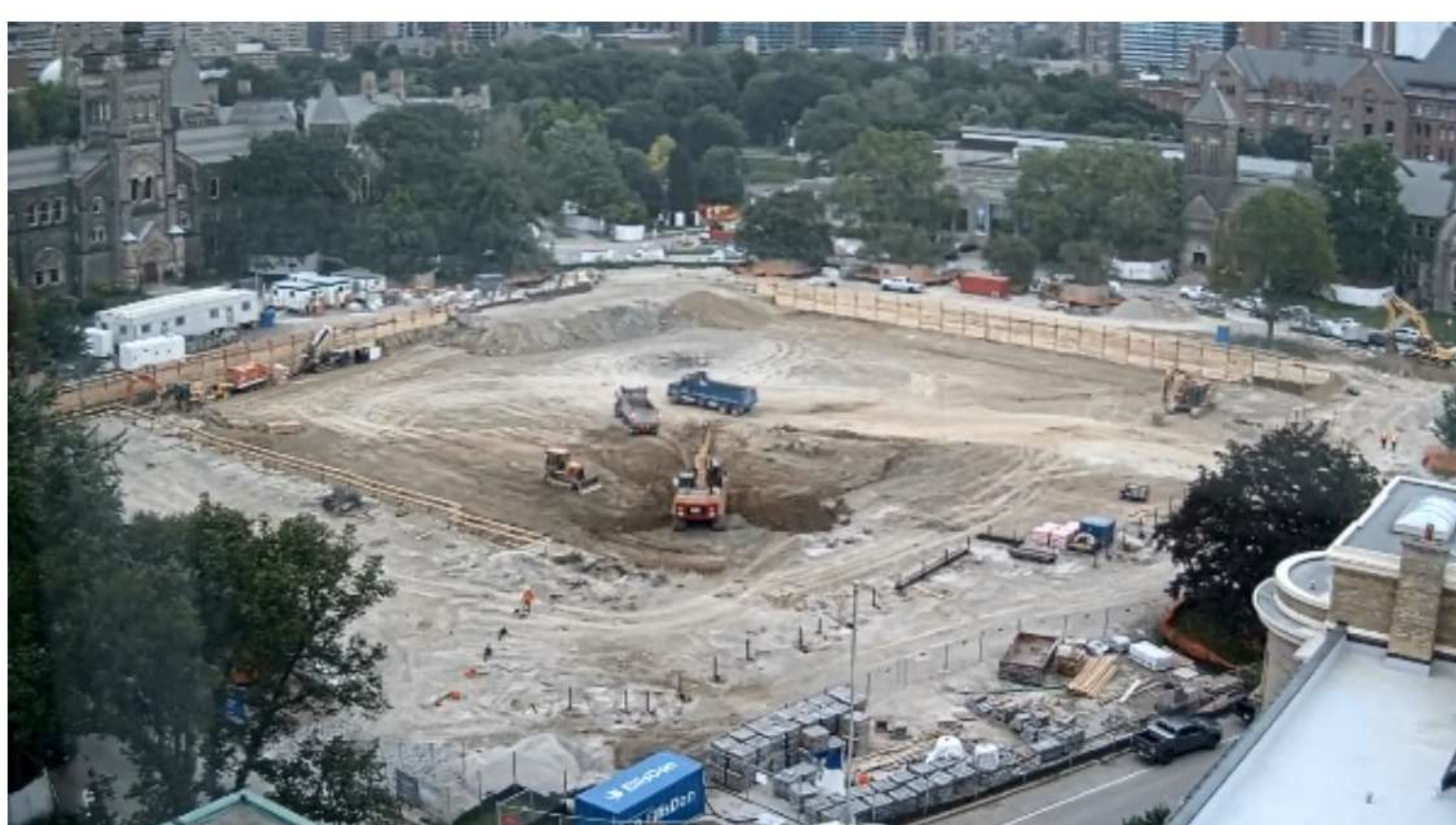
View of King's College Circle - August 2021