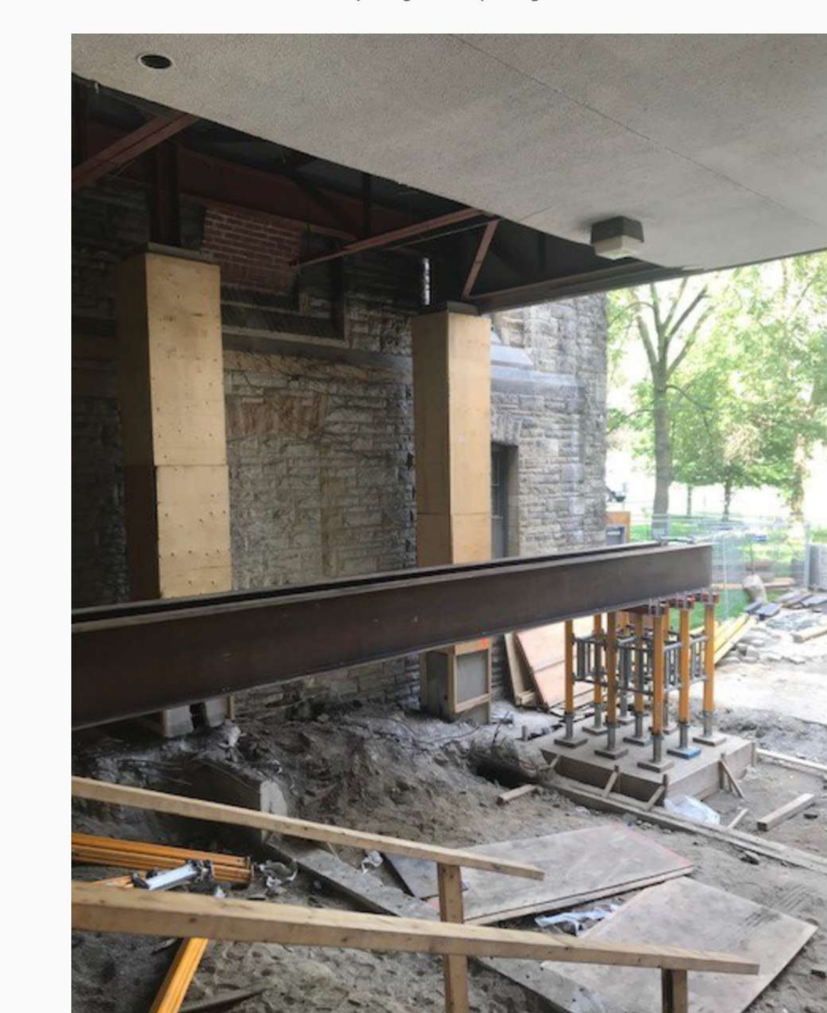
Medical Sciences Building column repairing - August 2021