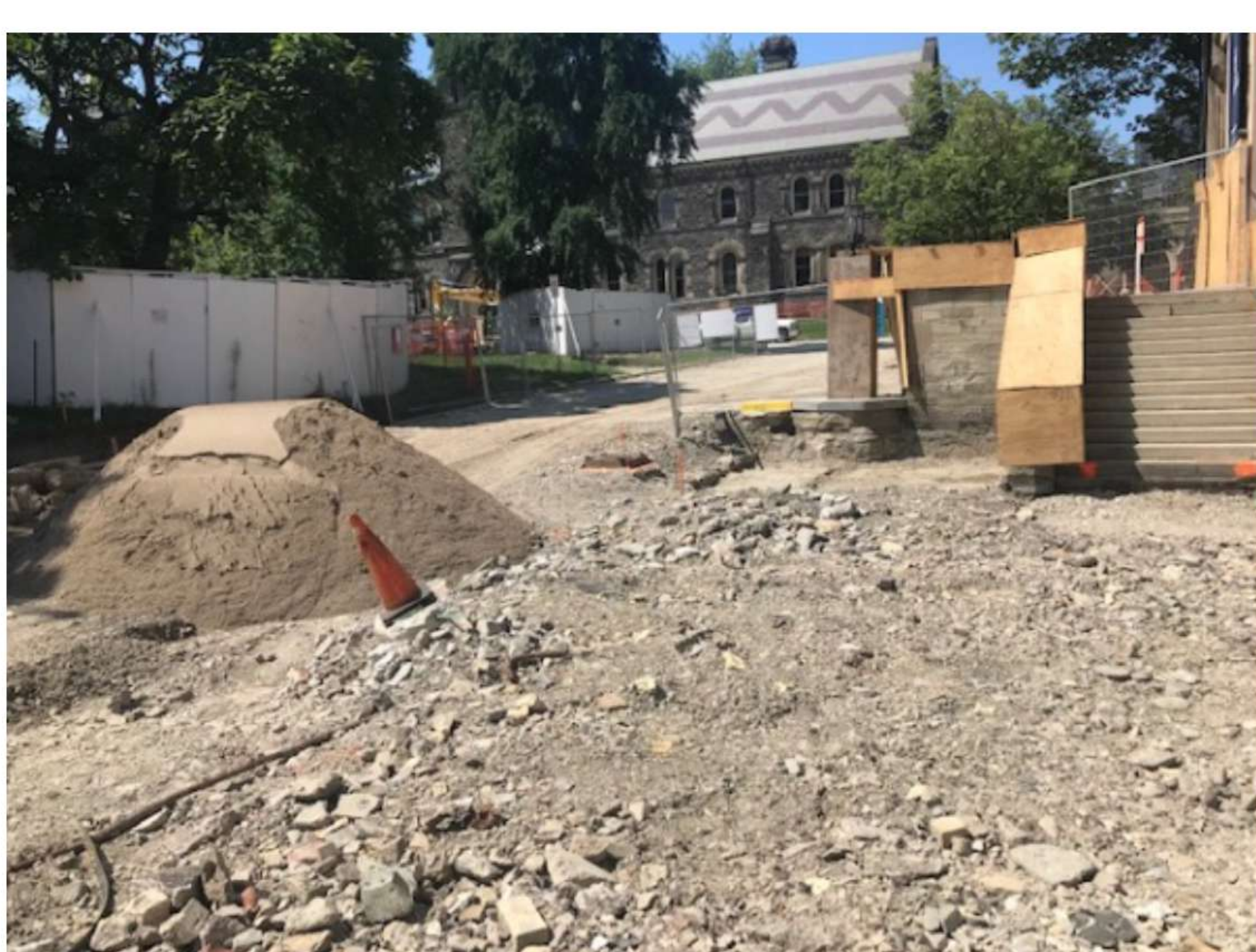
Hart House - August 2021