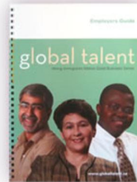
Guide for EMPLOYERS