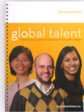
Guide for WORKERS